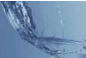
Dual jets create a strong siphon for an efficient flush.