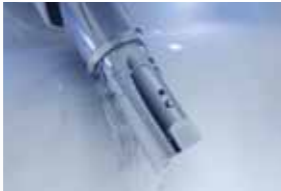
Self-cleaning: wand is automatically washed with sterilized water after every use