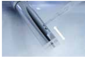
Oscillating wash: spray moves back and forth for more effective cleansing