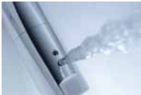
Rear wash: spiral spray offers broad cleansing coverage