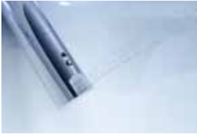
Front wash: air-infused gentle cleansing with 78 fine nozzles