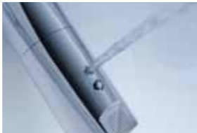
Pulsating wash: intermittent spray cleanses and soothes