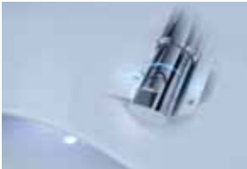
UV-sanitizing: UV light disinfects wand automatically every 24 hours