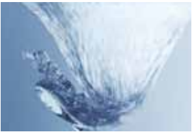
Powerful water flow eliminates bowl residue.

Adjustable sensor automatically opens and closes the seat cover. Choose from 3 available distance settings.