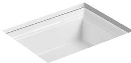
HARKEN™ SQUARE UNDER-COUNTER LAVATORY