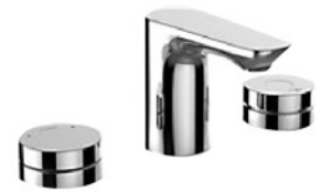
ALEO™ WIDESPREAD TOUCHLESS FAUCET