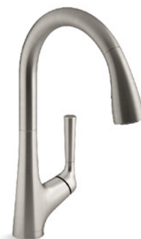
KOHLER MALLECO TOUCHLESS PULL-DOWN KITCHEN FAUCET SHOWN IN VIBRANT STAINLESS STEEL (VS)