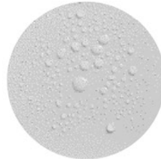
CERAMIC SURFACE WITH CLEANCOAT

Kohler cleancoat® technology ensures liquids bead up rather than stain the surface, preventing stains and water spots for unparalleled long-lasting hygienic effectiveness.