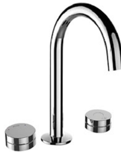
COMPONENTS™ WIDESPREAD TOUCHLESS FAUCET

Powered by a maintenance-free hybrid energy cell.