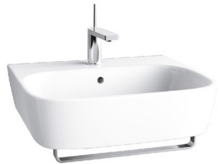
MODERNLIFE™ WALL-HUNG LAVATORY