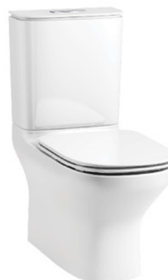
REACH™ 1PC SKIRTED TOILET