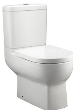
MODERNLIFE™ 2PC TOILET