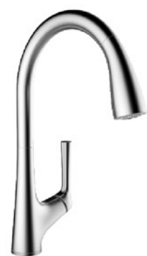
KOHLER MALLECO TOUCHLESS PULL-DOWN KITCHEN FAUCET SHOWN IN POLISHED CHROME (CP)