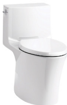
ODEON UP™ 2PC TOILET