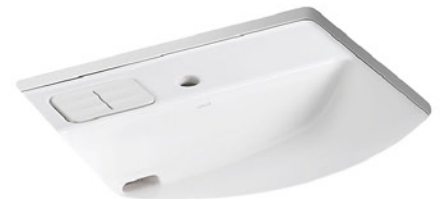
FAMILY CARE™ UNDER-COUNTER LAVATORY