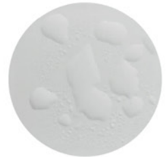
NORMAL CERAMIC SURFACE