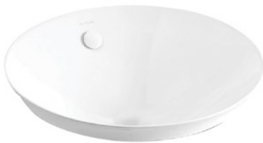
VEIL™ ESSENTIAL LAVATORY