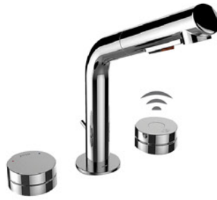
ALEUTIAN™ TOUCHLESS GROOMING FAUCET