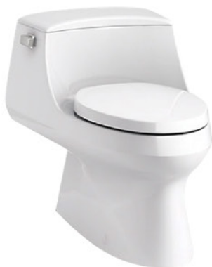
VEIL™ 1PC TOILET

Eco water consumption flushing (3/4.8l) satisfies leed and green building certifications' standards.