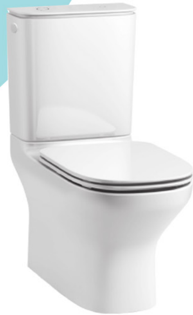
MODERNLIFE™ TOUCHLESS TOILET

Modernlife™ toilet's Rimless Flush enables each flush to reach the entire inner bowl, leaving nowhere to hide for germs and dirt. Kohler's innovative CleanCoat™ glaze applied on the toilet's ceramic ensures liquids to bead up rather than strain the surface, preventing the growth of stains and water spots for unparalleled longlasting hygiene effectiveness.