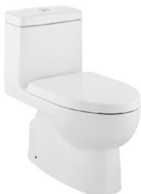
SAN RAPHAEL™ 1PC TOILET