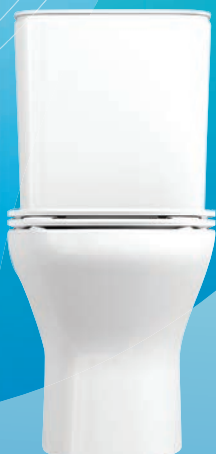
MODERNLIFE™ 2 PC

HYGIENE HAS BEEN IDENTIFIED AS KEY PRECAUTION TO AVOID TRANSMISSION OF THE NOVEL CORONAVIRUS COVID-19. FIND OUT HOW KOHLER PRODUCTS' ENHANCED HYGIENIC FUNCTIONS CAN PROVIDE BETTER PROTECTION TO YOUR FAMILY.