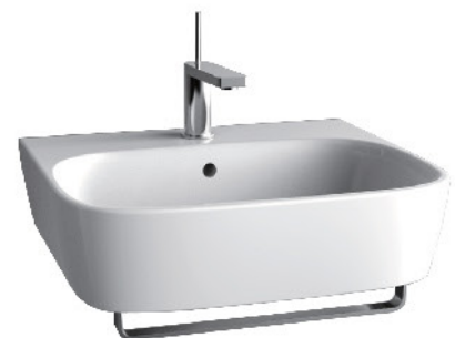
MODERNLIFE™ WALL-HUNG LAVATORY