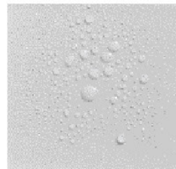
CERAMIC SURFACE WITH CLEANCOAT

KOHLER CLEANCOAT® TECHNOLOGY ENSURES LIQUIDS BEAD UP RATHER THAN STAIN THE SURFACE, PREVENTING STAINS AND WATER SPOTS FOR UNPARALLELED LONG-LASTING HYGIENIC EFFECTIVENESS.