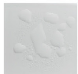
NORMAL CERAMIC SURFACE