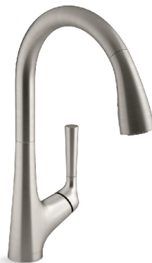
KOHLER MALLECO TOUCHLESS PULL-DOWN KITCHEN FAUCET SHOWN IN VIBRANT STAINLESS STEEL (VS)

TWO-FUNCTION PULL-DOWN SPRAYHEAD WITH TOUCH-CONTROL ALLOWS YOU TO SWITCH FROM STREAM TO SWEEP® SPRAY. SWEEP® SPRAY FEATURES SPECIALLY ANGLED NOZZLES THAT FORM A WIDE, POWERFUL BLADE OF WATER TO SWEEP YOUR DISHES AND SINK CLEAN.