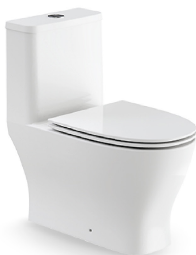
REACH UP™ 1PC/2PC