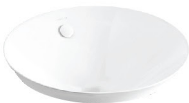
VEIL™ ESSENTIAL LAVATORY