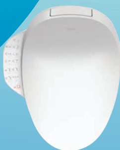
C3-520 FAMILY CARE™ BIDET SEAT