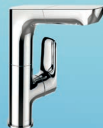
ALEO™ S GROOMING FAUCET