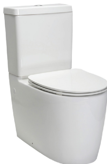
PARLIAMENT™ GRANDE 2PC