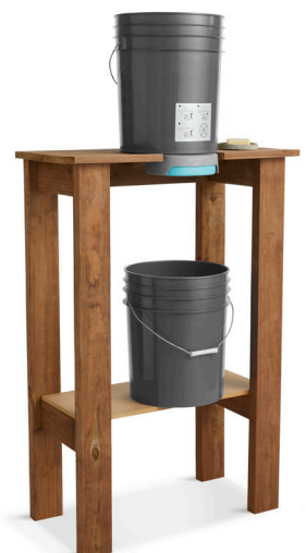
Bucket System Installation