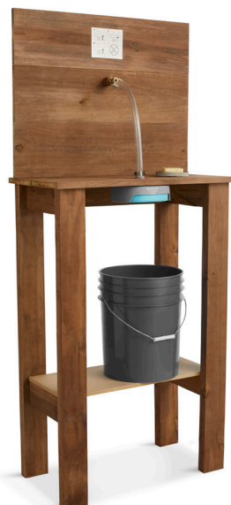
Gravity-Fed Hose Installation