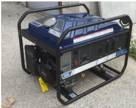
Kohler GEN5.0 Portable Generator