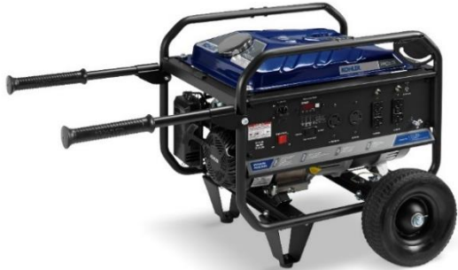
Kohler PRO3.7 Portable Generator