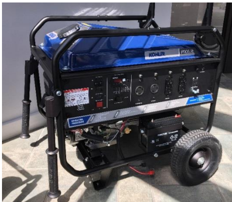
Kohler PRO5.2 Portable Generator