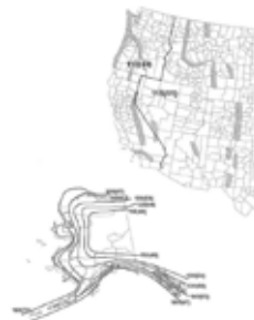
Figure 1.2 IBC Basic Wind Speeds: Basic Wind Speeds: Risk Category II.