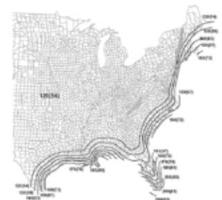
Figure 2.2 IBC Basic Wind Speeds: Basic Wind Speeds: Risk Category III and IV. Source: ASCE 7-10