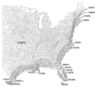
Figure 1.1 IBC Basic Wind Speeds: Basic Wind Speeds: Risk Category II.

The United States wind speed map provides information on basic wind speed in miles per hour in geographic zones. The basic wind speed maps are categorized based on Risk Category I, II, III and IV. Risk Category is selected based on the Use or Occupancy of Buildings and Structures. Please refer to ASCE 7-10, Table 1.5-1 for details. Standby power system is usually considered in Risk Category II or III and IV. Figures 1 and 2 show basic wind speed versus geographic regions in the United States for Risk Category II, III and IV, respectively. The first step is to identify the Risk Category based on the Use or Occupancy factor based on ASCE 7-10. Table 1.5-1 is used to determine the installation location's basic wind rating speed. While most of the United States has a basic wind rating speed of 110 miles per hour, special regions, particularly along the Atlantic and Gulf coasts, have ratings of up to 186 miles per hour. Figure 1 shows basic wind speed versus geographic regions in the United States.