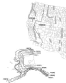
Figure 2.1 IBC Basic Wind Speeds: Basic Wind Speeds: Risk Category III and IV.